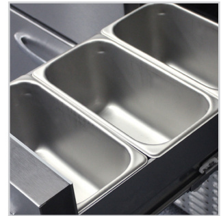
Drawer in lieu of door above the condensing unit