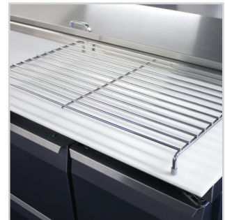
Wire rod garnish rack