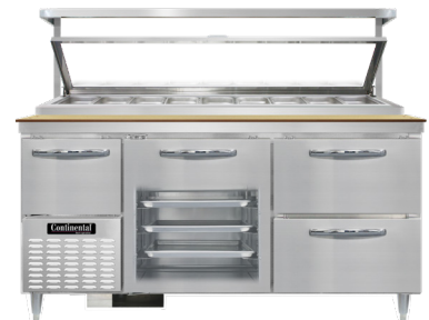
16-Gauge Overshelves (single or double)