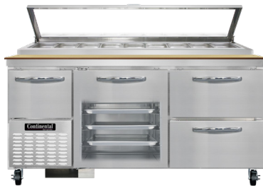
Vision Panel Lid & Front Breathing