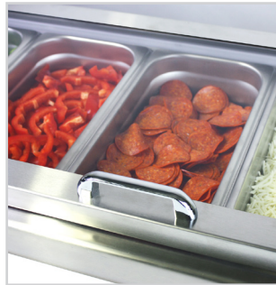
Vision panel lid