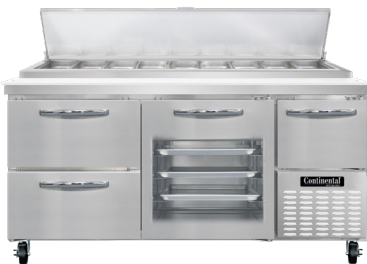
2-Tier Drawers & Pan Slides (door removed for viewing purposes)