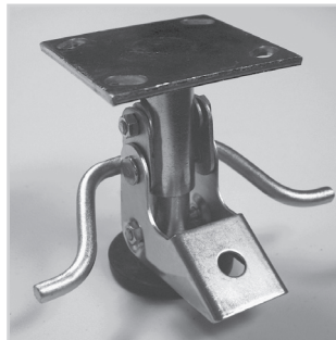
Floor foot pedal lock