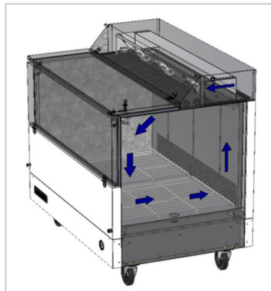
Airflow on MC4NS model

Cold Wall and forced air technology allows optimal cooling, keeping milk products cold prior to serving.