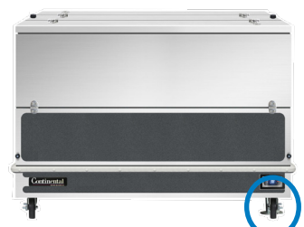
Wrap Around Bumpers & Foot Lock (see next page)