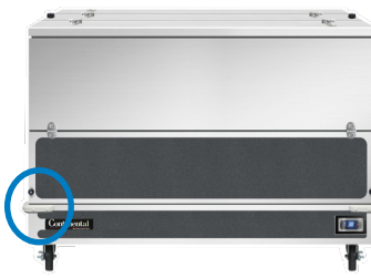
Corner Bumpers (see next page)