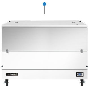
Standard Model (Cold Wall)