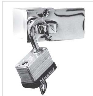
Locking hasp (lock not included)