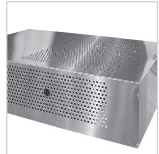
Stainless steel mesh security cover